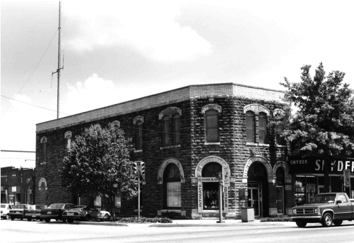
Citizens' State Bank of Edmond